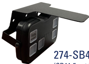
274-SB44-H (SB44-5 not included)